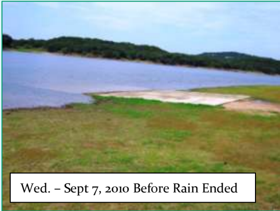
Wed. - Sept 7, 2010 Before Rain Ended

Hello, all and Happy Rain Dances to us. From the Tropical Storm, Hermine, we received almost 7 " of rain and our lake is now up over 5 ' to 671.5 above sea level as of 9/9/2010.