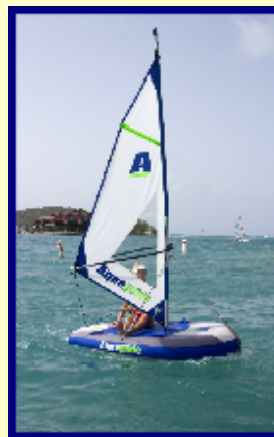
AquaGlide Multi Sport

The Texas Dealer for inflatable pontoon craft, inflatable kayaks, kayak paddles and inflatable swim floats & toys.