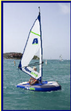
AquaGlide Multi Sport

The Texas Dealer for inflatable pontoon craft, inflatable kayaks, kayak paddles and inflatable swim floats & toys.