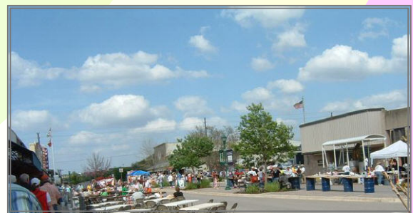
Blues on Main Street

playing for the function and the weather cooperated to make this a fine annual event! The Bluebonnet Blues & Fine Arts Festival was presented by the Historic Main Street of Marble Falls and featured good blues plus many local artists and artwork. The art and artists were found throughout the town.