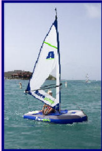
AquaGlide Multi Sport

The Texas Dealer for inflatable pontoon craft, inflatable kayaks, kayak paddles and inflatable swim floats & toys.